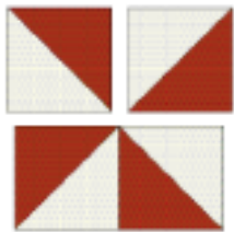
Block Assembly Diagram